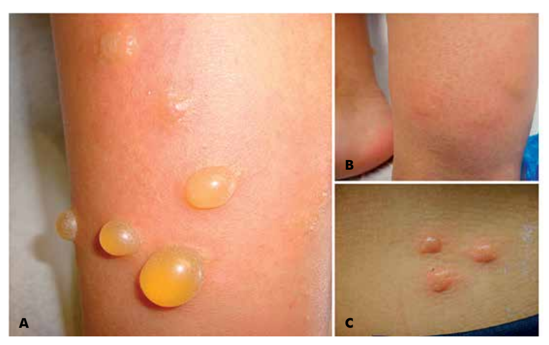
Fig 1 - Clinical appearance of our patient. Multiple tense blisters with citrine content in right leg (a), erythematous urticarial papules in left leg, some of them with small vesicles in the center (b), and similar lesions with overt vesicles on the lumbar area (c).

with eosinophils were present (Fig. 2). Direct immunofluorescence was negative. Blood tests revealed increased C-reactive protein (14.1 mg/L, normal: <3.0), total IgE (249 kU/L, normal: <114), C4 (39 mg/dL,