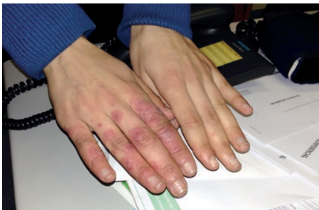
Fig 2 - Patient suffering from chilblains one week after using a glove impregnated with a vasodilator and anti-inflammatory natural ingredient (left hand).

The best solution is the use of gloves and/or socks impregnated with one or more products with vasodilators and anti-inflammatory properties, without inducing skin irritation. This goal can be reached with some natural ingredients that increase the local blood efflux and have anti-inflammatory effects. 44-54 Furthermore, some of these natural ingredients have an antiseptic and antifungal activity.