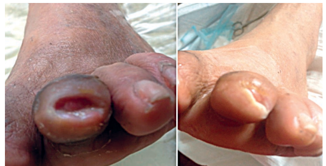
Fig 3 - The foot of a patient suffering from diabetic ulceration before and one month after using a sock impregnated with a vasodilator and anti-inflammatory natural ingredient.

Furthermore, they prevent damaging of mitochondrial material of the endothelial cells by oxidative stress, avoiding damage and subsequent cell death after oxygen glucose deprivation. 50