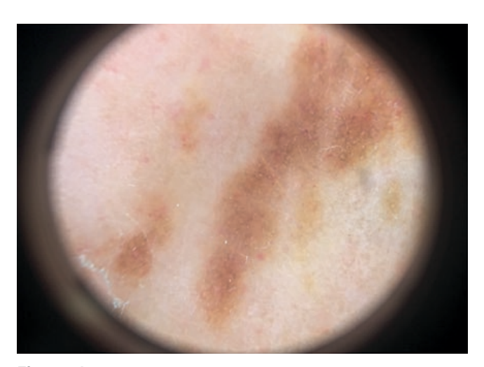
Figure 2 - Dermoscopy of lichen aureus showing an amorphous copper-colored area with no pigmented network.

Dermoscopy showed a copper-colored amorphous area with no pigmented network (Fig. 2). Histopathology of the biopsy taken from the medial malleolus showed chronic pigment purpura with hemosiderin deposits in the dermis and a lichenoid pattern compatible with the diagnosis of lichen aureus (Fig. 3).