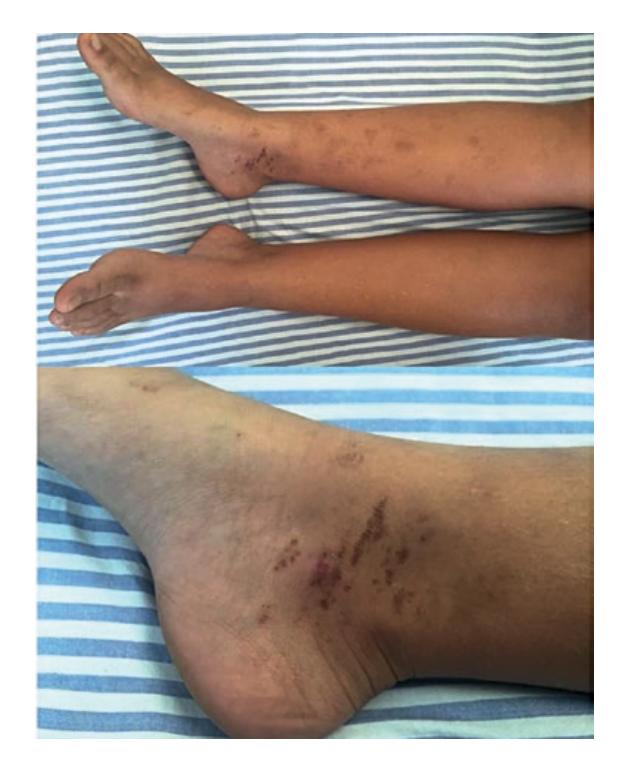
Figura 1 - Unilateral lesions of lichen aureus.

We observed several linear purplish-brown maculopapular lesions, with mild lichenification and a purpuric component near the medial right malleolus associated with macular pigmented lesions that extended along the leg to the knee (Fig. 1).