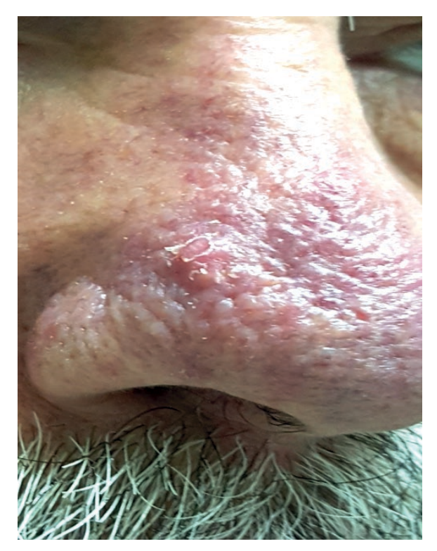
Figure 4 - Phymatous rosacea.