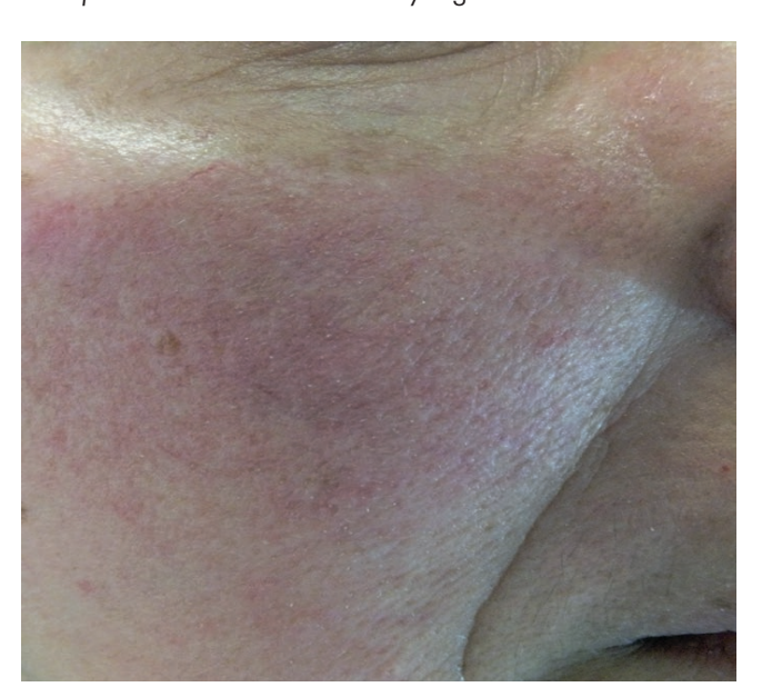
Figure 1 - Erythemato-telangiectatic rosacea.

Often both patients and non-dermatologist physicians underestimate the condition, taking it as a merely cosmetic concern or, otherwise, view it just as minor psychological ailment. In fact, blushing – the most peculiar and the most human of all expressions<sup>6</sup> – has been usually regarded as a hallmark of