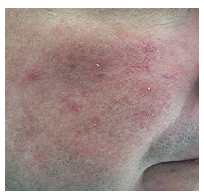
Figure 2 - Erythemato-telangiectatic rosacea.