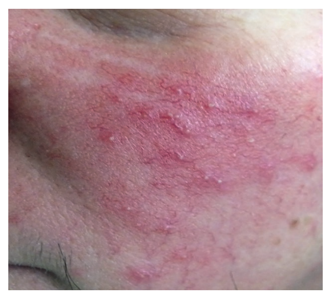
Figure 3 - Papulo-pustular rosacea.