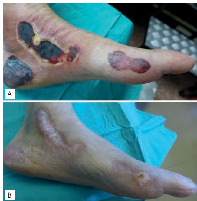
Figure 3 - Necrotic eschars after the third cycle of gemcitabine (A). Complete ulcer healing 4 months after initial presentation (B).

The anti-neoplastic treatments were suspended for 49 days, leading to a significant improvement of the ulcerations.