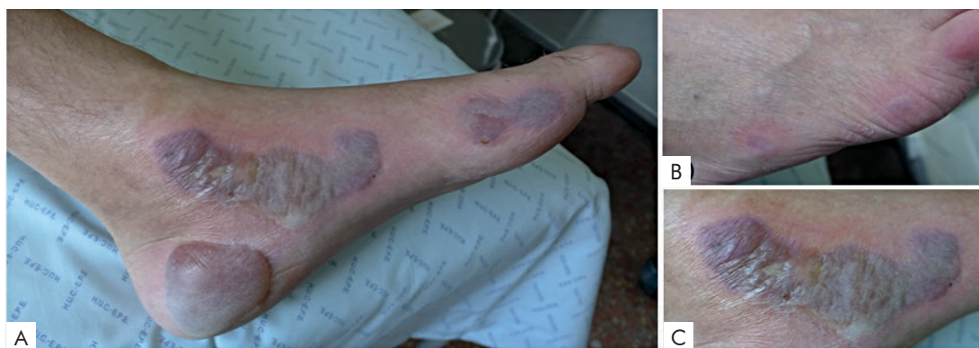
Figure 1 - Large bullous lesions on the left foot, 2 days after second cycle of gemcitabine (A). Smaller bullous lesions on the right foot (B). Detail of a bullous lesion (C).

After a slight improvement with high potency topical corticosteroids, there was clear worsening after a new gemcitabine infusion 12 days after the previous administration, with ulceration and necrotic eschars in the previously affected locations (Fig. 3a).