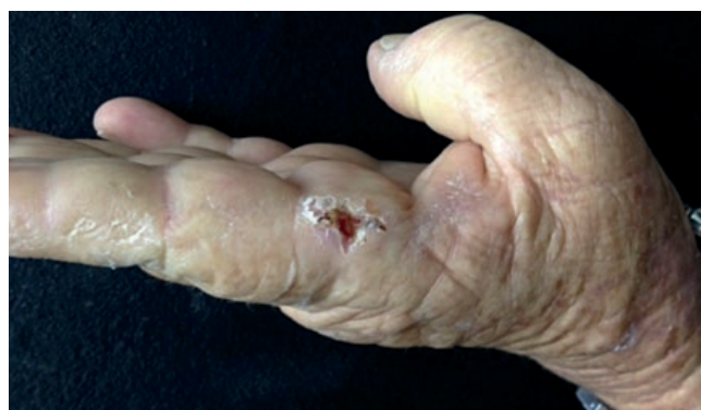
Figure 1 - Ulcer with an erythematous border and keratotic areas on the side of the second finger on the area of palmar marginated keratoderma.

an ulcer with erythematous border and keratotic areas, measuring 0.5 cm on the lateral side of the second finger, over MPK area (Fig. 1). Histopathology showed a well differentiated