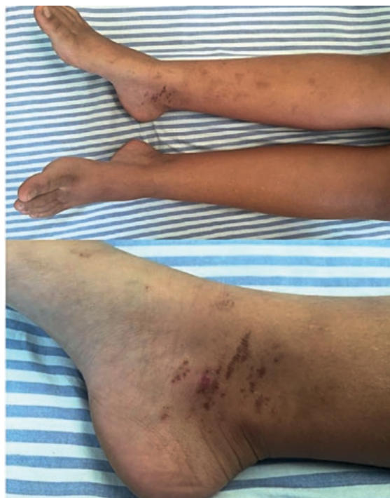
Figura 1 - Unilateral lesions of lichen aureus.

We observed several linear purplish-brown maculopapular lesions, with mild lichenification and a purpuric component near the medial right malleolus associated with macular pigmented lesions that extended along the leg to the knee (Fig. 1).