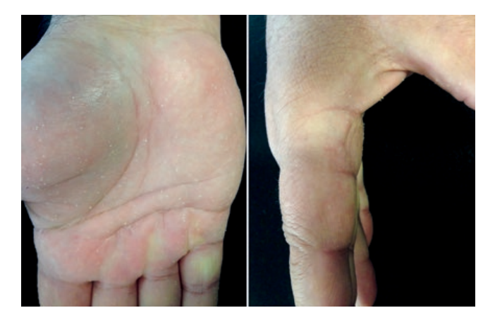
Figure 1 - Multiple digitate projections arising in the palmar surface of the hands.

A 65-year-old caucasian male presented with multiple filiform hyperkeratotic papules in the palmar aspect of his hands which were present for the past year (Fig. 1). These papules had a cylindrical shape and were 0.2-0.5 mm wide and 0.5-2 mm tall. No other similar lesions were found in other locations. They were asymptomatic and the patient re-