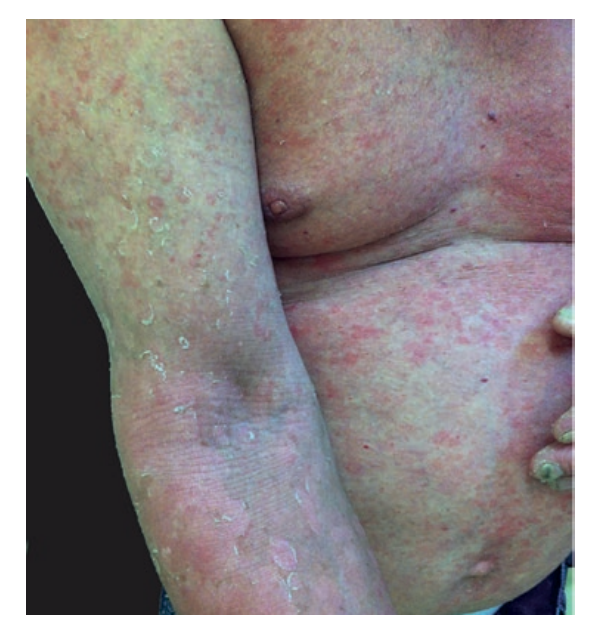
Figure 1 – Ichtyosis linearis circumflexa: Polycyclic erythematous scaly plaques on the trunk and upper extremities.

We performed trichoscopy of the eyebrows that showed nodules along the hair shaft and distal fractures (Fig.s 2a and 2b). The trichoscopic examination of the hair of the scalp did not identify any changes.