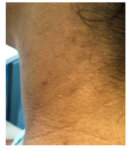
Figure 1 - Multiple discrete skin-colored papules in the neck.

Histopathology from an incisional skin biopsy on the cervical plaque revealed an acanthotic, hyperkeratotic epidermis; transepidermal elimination of numerous, branched, sawtooth-like elastic fibers; a mixed dermal inflammatory infiltrate and some multinucleated giant cells (Fig.s 3-4). These findings suggested a D-penicillamine induced dermopathy. From the clinicopathological correlation a diagnosis of penicillamine-induced