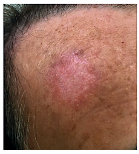
Figure 1 - Annular plaque on the forehead with an atrophic and hypopigmented center and raised erythematous margins.

A 51-year-old caucasian female presented with an 18-month history of an asymptomatic well demarcated annular plaque with central atrophy and raised erythematous margins on her forehead (Fig. 1). The patient had no associated systemic manifestations and denied any preceding local trauma or exposure to previous medication. There was no relevant personal or family history. Laboratory studies were unremarkable. Histopathologic examination showed a granulomatous infiltrate with numerous multinucleated giant cells surrounding solar elastosis (Fig. 2A). Verhoeff-van Gieson stain revealed elastophagocytosis (Fig. 2B). No infectious agents were identified after staining with Ziehl-Neelsen, Grocott and periodic acid-Schiff (PAS).