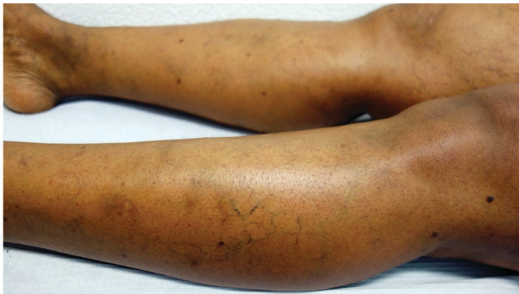
Figure 1 - Multiple dark-brown firm non-tender papules in the lower limbs, with 2-8 mm in diameter.

was possible to verify that when lesions began there was a decrease in the CD4 + T cell count (9 cells/mm 3 ) and an increase in the viral load (454300 copies/mL). Afterwards, there was a change in the highly active antiretroviral therapy (HAART), with addition of dolutegravir to etravirine, ritonavir and darunavir. CD4 count increased to 174.6 cells/mm 3 , and at the moment