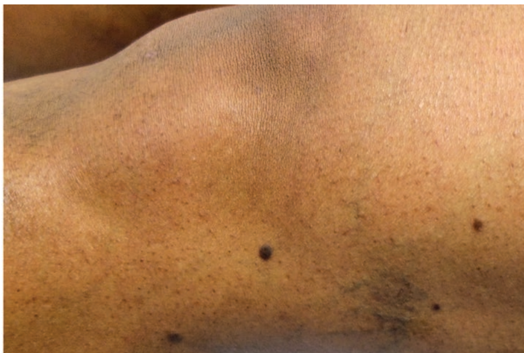
Figure 2 - Multiple dark-brown firm non-tender papules around the knee, with 2-8 mm in diameter.

The excisional biopsy showed a nodular dermal proliferation, predominantly of spindle-shaped fibroblasts and myofibroblasts arranged as short intersecting fascicles, consistent with dermatofibroma (Fig.s 3 and 4).