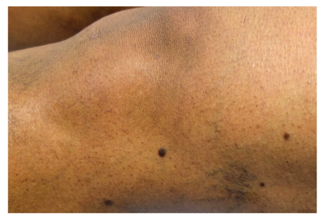
Figure 2 - Multiple dark-brown firm non-tender papules around the knee, with 2-8 mm in diameter.

The excisional biopsy showed a nodular dermal proliferation, predominantly of spindle-shaped fibroblasts and myofibroblasts arranged as short intersecting fascicles, consistent with dermatofibroma (Fig.s 3 and 4).