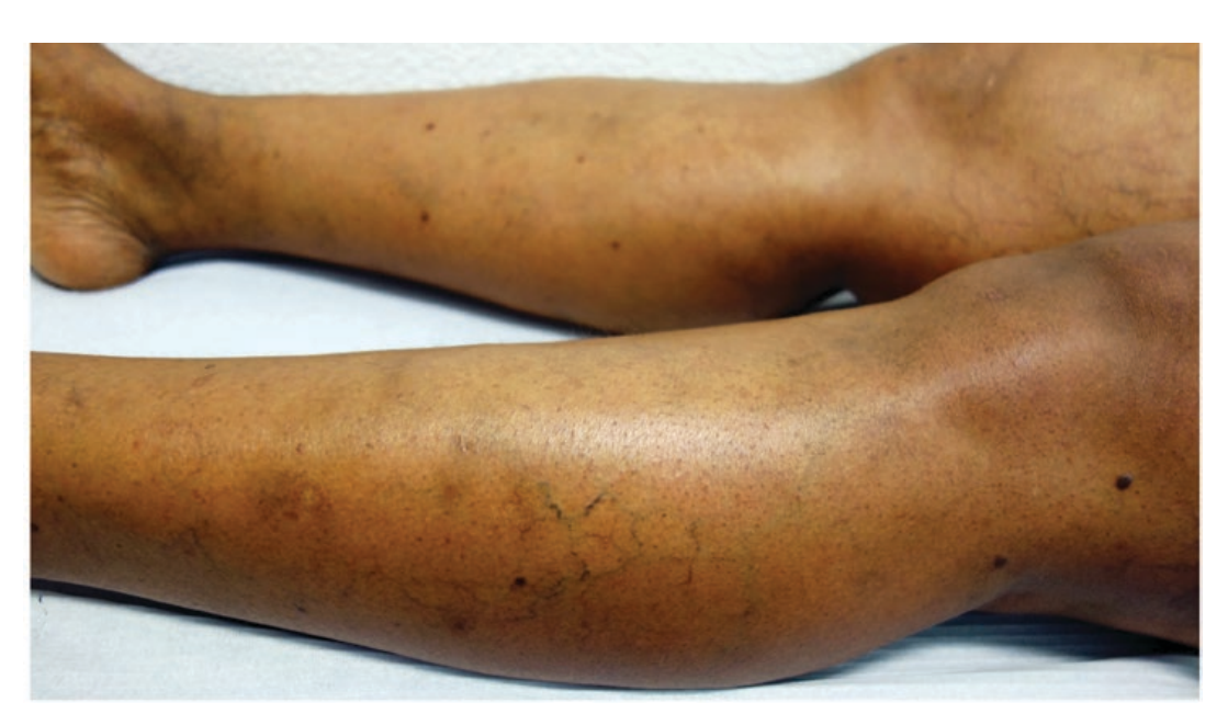
Figure 1 - Multiple dark-brown firm non-tender papules in the lower limbs, with 2-8 mm in diameter.

was possible to verify that when lesions began there was a decrease in the CD4+ T cell count (9 cells/mm³) and an increase in the viral load (454300 copies/mL). Afterwards, there was a change in the highly active antiretroviral therapy (HAART), with addiction of dolutegravir to etravirine, ritonavir and darunavir. CD4 count increased to 174.6 cells/mm³, and at the moment