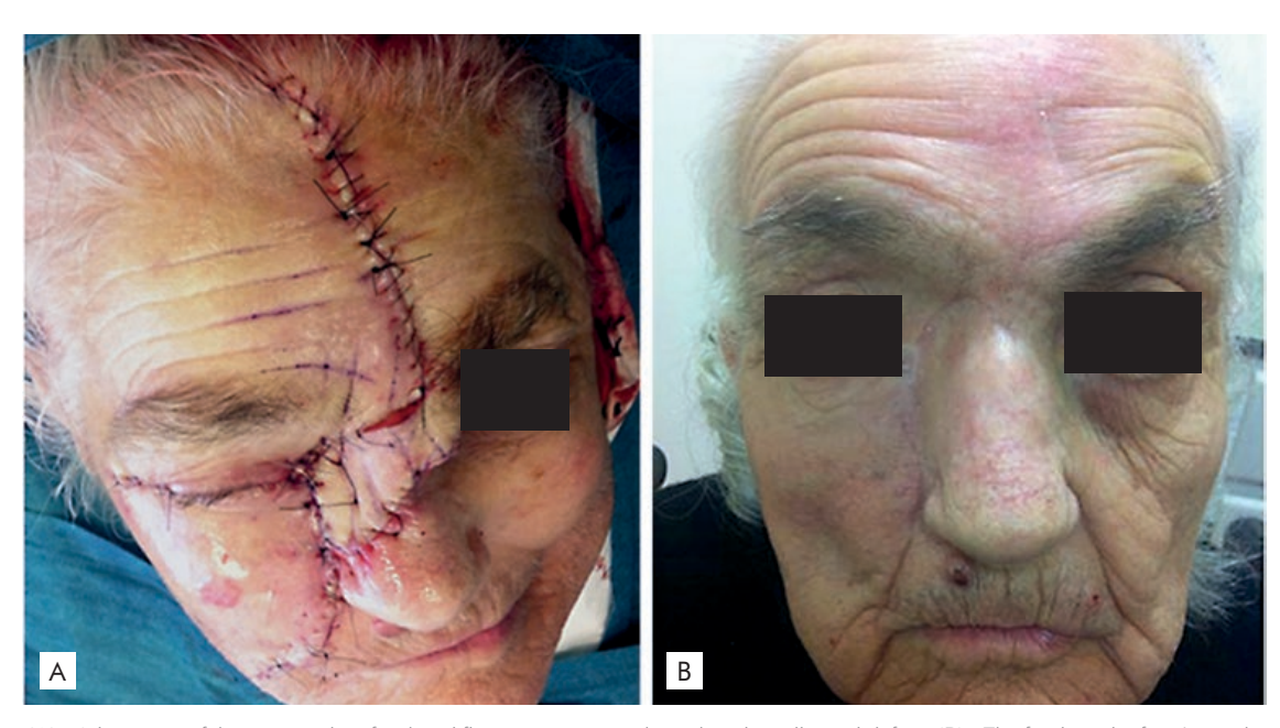
Figura 3 - (A) - Adaptation of the paramedian forehead flap to reconstruct the right side wall nasal defect. (B) - The final result after 6 months of follow-up.

For the lower eyelid defect we used the Tenzel semicircular flap (Fig.2A). This was dissected in a suborbicularis plane, beginning at the lateral canthus and extending superiorly in a semicircular pattern with a little slope. The musculocutaneous flap was elevated and the dissection was carried down to the lateral orbital rim. A lateral canthotomy was performed, followed by lysis of the lower-lid tendon at the canthal angle and the eyelid and flap were advanced medially to close the defect. A double-armed 4-0 nylon suture with half-circle needle was used between the cut edge of the Tenzel flap and the periosteum of the lateral orbital rim. The double-armed suture was then tied externally 3 to 4 mm from the rim's edge.