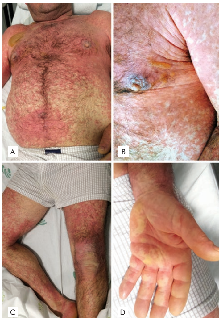
Figure 1 - Erythema with blistering and epidermal detachment involving the trunk (A,B). Skin lesions progressed to widespread erythema with blisters involving arms and limbs (C, D).

Eight days later, the patient developed a grade 2 maculopapular rash (Common Terminology Criteria for Adverse Events version 4.0 of the National Cancer Institute), initially restricted to lower limbs, associated to high fever (39.3°) and pruritus. During the following three days, the skin lesions progressed to widespread erythema with blisters involving head, trunk, arms and limbs (Fig. 1). Bilateral conjunctivitis, large erosions and ulceration of the oral mucosa were observed (Fig. 2). Laboratory investigations showed just a mild increase in liver aminotransferases (two times normal). The patient denied taking any other drugs. On clinical assessment, SCORTEN (SCORE of Toxic Epidermal Necrolysis) was calculated as 3, predicting a mortality rate of > 35%. The ALDEN